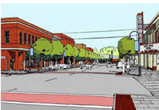
Downtown Design Study (2004)