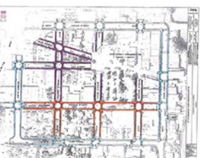
Downtown Revitalization Study Report (2004)