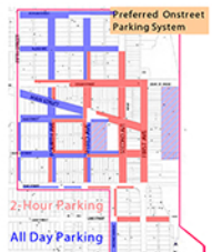
Downtown Parking Study (2004)