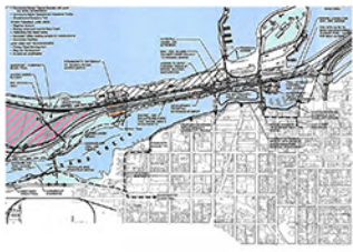
Sand Creek Conceptual Master Plan (2001)