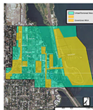
Urban Renewal Plan (2010)