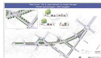
"The Curve" Highway 2 Realignment - Preferred Concept (2011)